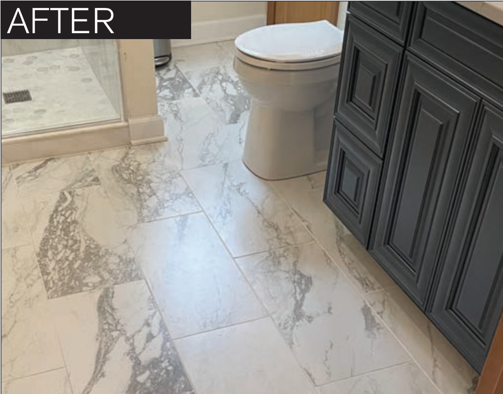
An eye-catching floor replaces the linoleum floor that Jo Juhl-Johnson wanted upgraded in her bathroom.