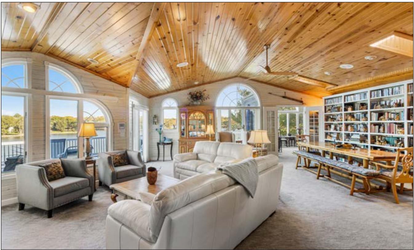
Massive windows provide a stunning view of the lake. Wooden ceilings carry through the main house and additions.

After showing their rough sketches to several contractors, the couple was told to give up the dream of adding any more rooflines to those already existing. Most said it couldn’t be done or that it would end up looking “tacky.” But the Dilleys persevered.