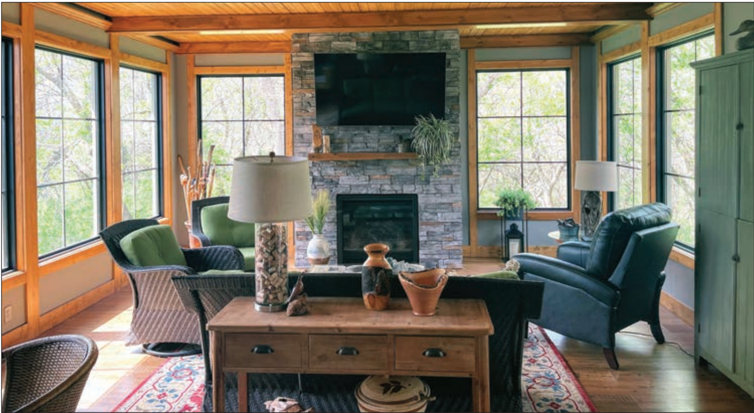
A stone-faced fireplace makes the four-season room cozy year-round.

Work began on the scheduled eight-week project, but the nationwide material and labor shortages that hamstrung most industries caused some unforeseen delays. It was no one's fault. All hands were tied. Eight weeks soon turned