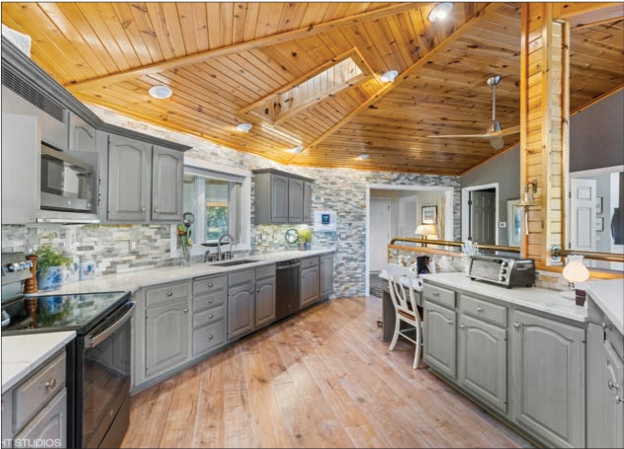
The kitchen of the Dilley home features contrasting materials complementing each other.

and car-sided walls; from matching the existing kitchen cupboards and stone splash and granite countertops, to using identical window and door trim,” Dilley says. “And, sure enough, the biggest compliment we’ve received from family and friends is that the final home product looks like it’s always been here. Now that’s a feat.” ■