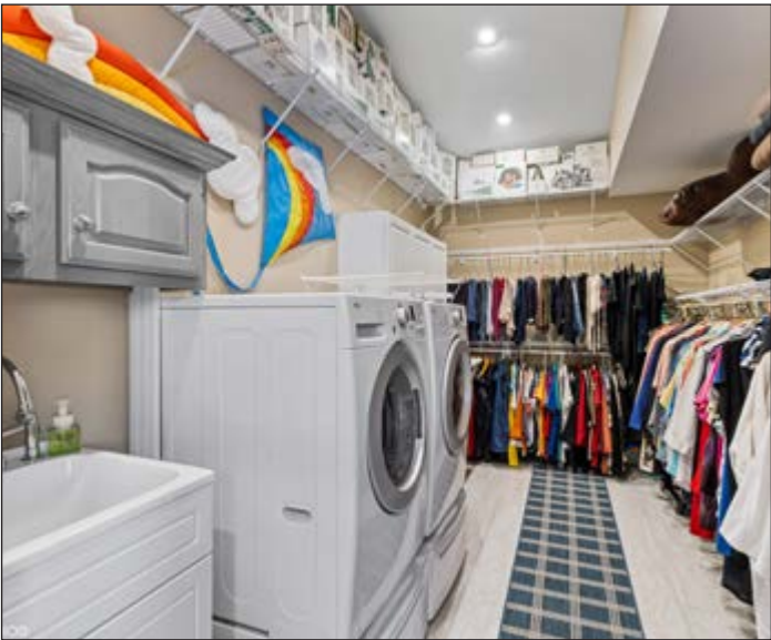
In the process of reconfiguring their home, the Dilleys moved the laundry room into an area with plenty of storage.

and car-sided walls; from matching the existing kitchen cupboards and stone splash and granite countertops, to using identical window and door trim,” Dilley says. “And, sure enough, the biggest compliment we’ve received from family and friends is that the final home product looks like it’s always been here. Now that’s a feat.” ■