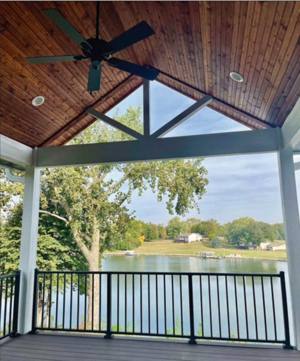
A deck off the back of the Till house offers a wonderful view of the lake, and, since it is partially covered, the view can be enjoyed even when it's raining.